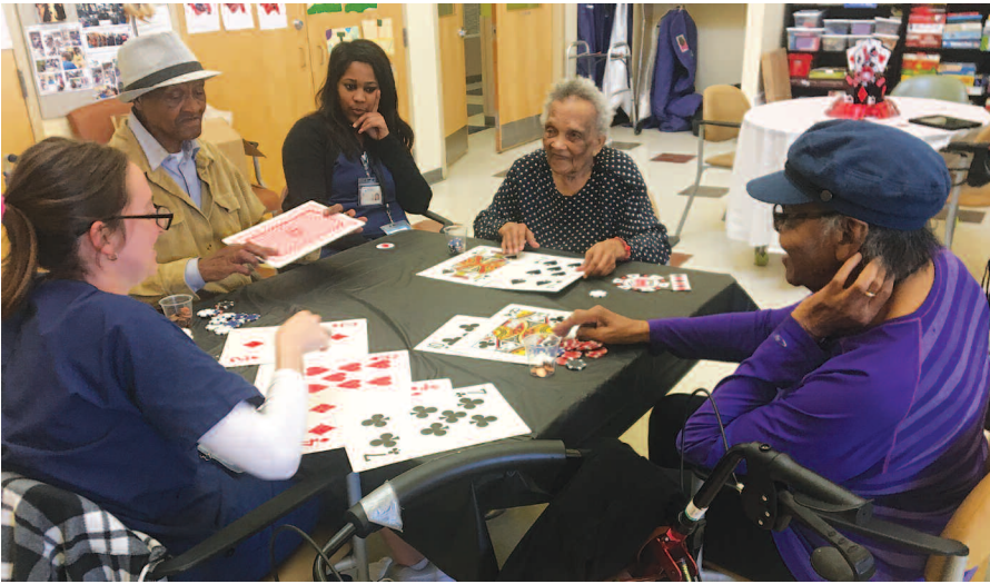
Our neighbors playing games during "Casino Day."

The butterfly for Adult Day: Our neighbors have reached a phase of their lives where the beauty of their wisdom comes through transformation. We cherish our elders and look to them as an example of growth and maturity.