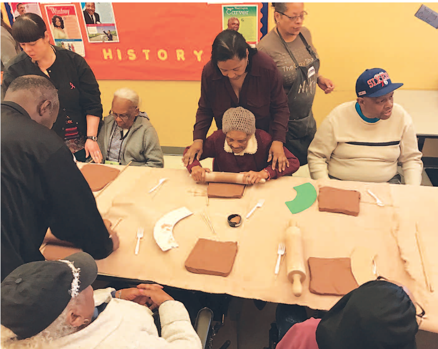
Weekly sessions from the Claymobile, funded by the SSJ Mission Grant, have been a welcome addition to the Adult Day program.