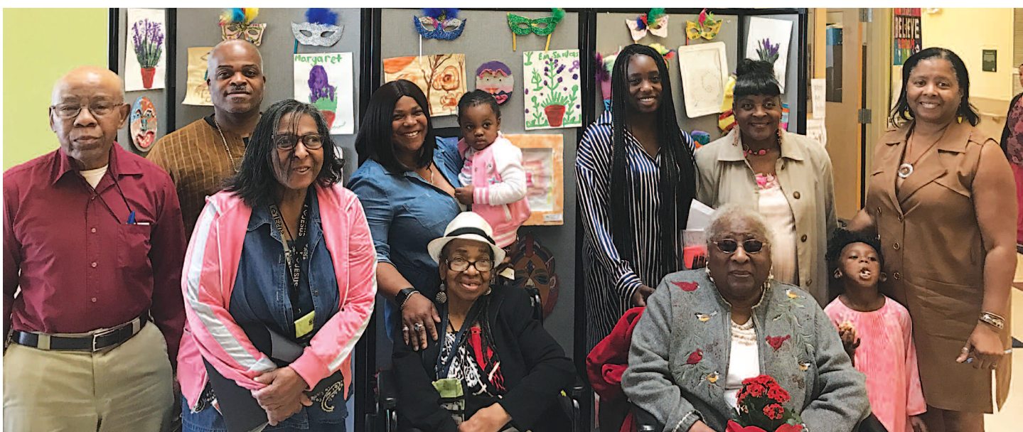
Our "original" Adult Day clients remain dedicated members of the Mercy Family.