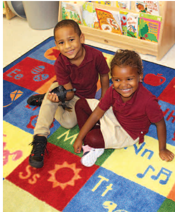
A typical day at Face to Face.