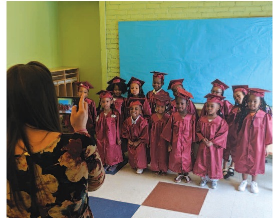
Behind the scenes at Move Up Day.