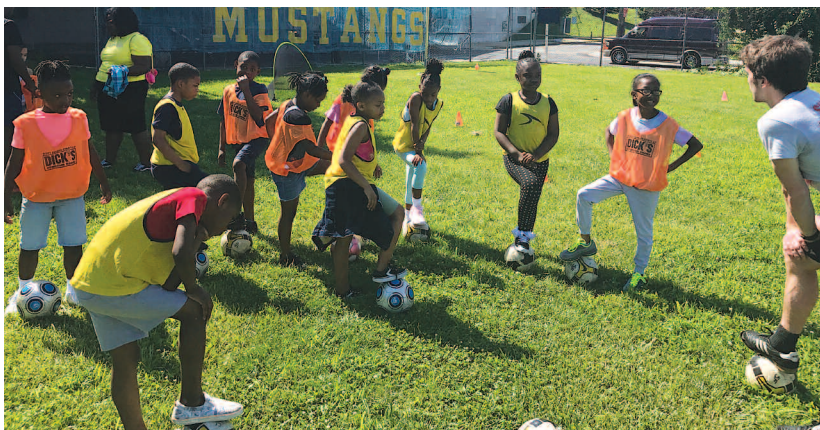
The first day of soccer kicks off at Tioga field with our partners at the Starfinder Foundation.