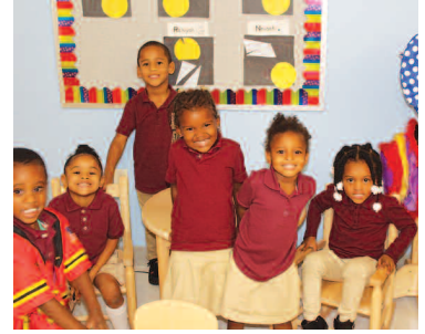
Students in Germantown carrying on a tradition of smiles in Mercy Pre-K at Face to Face.