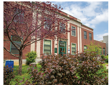
The Mercy Family Center brightening Venango Street.