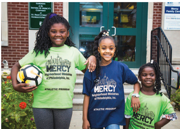
The young ladies of Mercy are ready for exciting after-school programs.