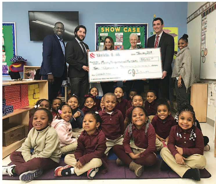
Meridian Bank supports Mercy programs with a $10,000 donation through the State of Pennsylvania's EITC program.