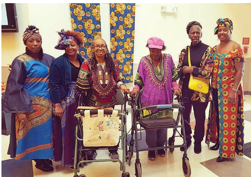
Adult Day staff and neighbors celebrate United Nations Day.