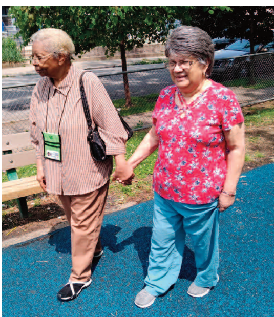
Some days, a stroll in the park is all we need.