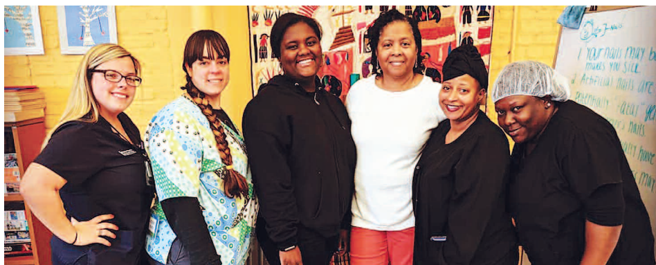
Adult Day staff brightening the day of our community members.