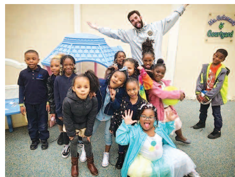
Clowning around during a visit from the Philadelphia Union.