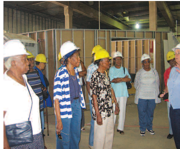
Neighbors and developers tour the site of Mercy Family Center during the early stages of construction.