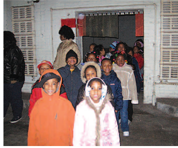
Our after-school students take their first look at their future learning space circa 2007.

Mercy receives Keystone STARS Level 4 accreditation at our second location.