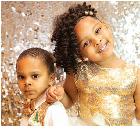
Students shining at the annual Mercy Prom.

The Patricia Kind Family Foundation Rite Aid Foundation KidCents