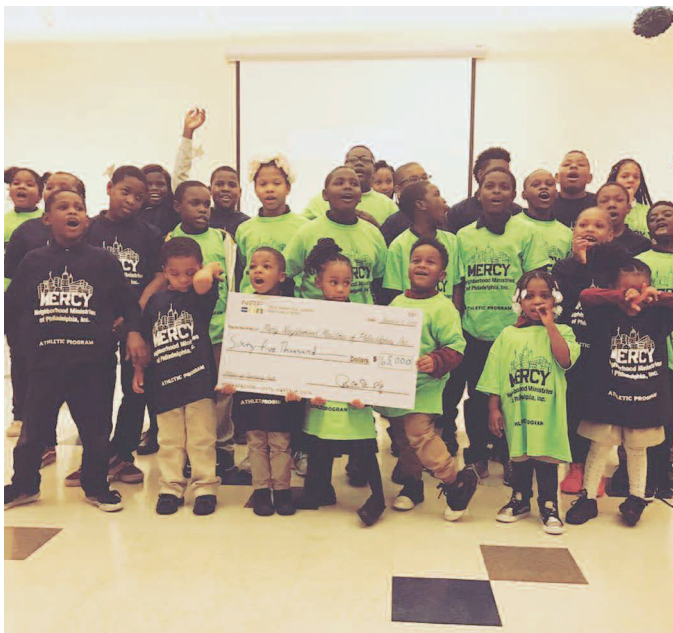
Mercy Students celebrate a $65,000 grant from the National Recreation Foundation to initiate sports programming.