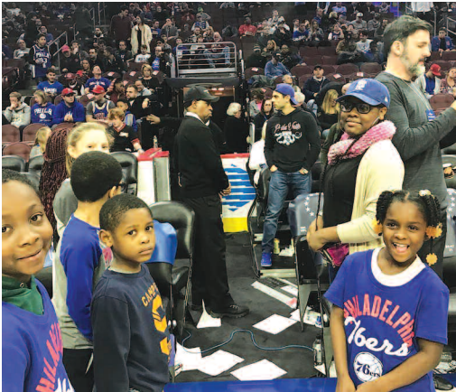
Our students waiting outside the "high five tunnel" during Mercy Night at the Sixers.

Students participated in soccer programming at summer camp.