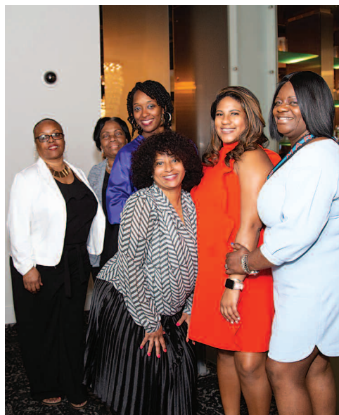
The Mercy Staff celebrating a successful year.